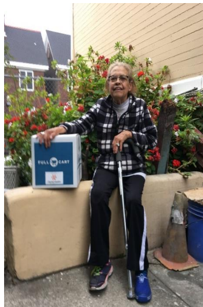
An MNC senior receives their food box

MNC would like to extend our gratitude to Dignity Health for facilitating an urgently needed donation of 250 boxes of food from AARP for our seniors. This vital food donation helped our MNC team to address food insecurities for our most vulnerable elders who are unable to leave their homes for groceries.