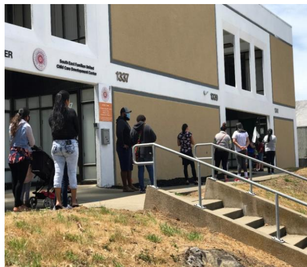
Families receive essential food supplies at our Family Resource Centers

In collaboration with the Latino Task Force, we have been able to provide food to 300 MNC families, including home deliveries to those who are unable to travel or at high risk for COVID-19.